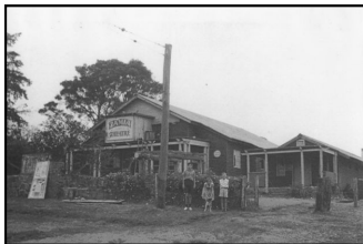
The historic Zamia Theatre - circa 1956

Subs can be paid to the Treasurer or sent to TMLT, P.O. Box 352, North Tamborine, 4272. We hold monthly meetings on the first Tuesday of each month at 7.00 pm at the Zamia Theatre in Main Street and all members are invited to attend. Our Newsletter is published monthly online and emailed to all members, if you do not have an email address please let the Newsletter editor know and he will mail you a copy, it will tell you about upcoming events.